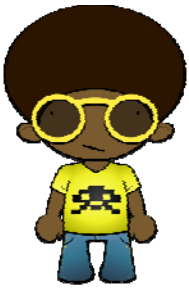
Computer Games Designer