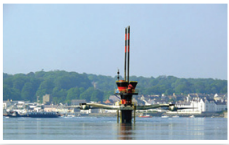
Tidal turbine, Strangford Lough, Northern Ireland, generating electricity from tidal streams was plugged into UK's national grid in July, 2009

The UK is committed to reduce CO2 emissions by 50% by 2020 . One of the key drivers towards reaching this ambitious target is the Government's obligation under the EU Renewable Energy Directive to generate 15% of energy from renewable energy resources by 2020 – this is equivalent to a 7 fold increase in UK renewable energy consumption from 2008 levels.